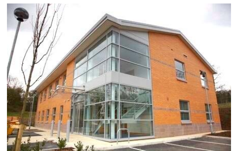
ADA's new offices in Leeds, UK

"ADA is moving from strength to strength